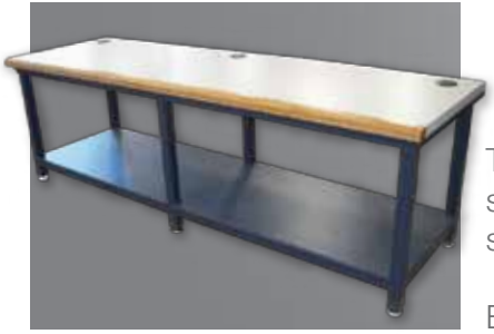
Bottom: Printer table