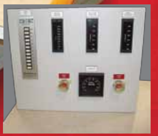
AUXILIARY PANEL Shown with drum levels, meters and pushbuttons

As a premier manufacturer of control panels, control houses and enclosures for some of the world's major firms, Panelmatic is often called upon to custom design stand-alone fixtures.