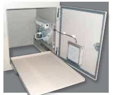
Top: Optional slide-out shelf w/ wall mounted sub panel