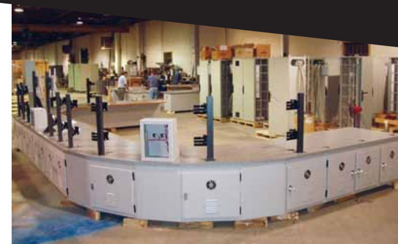
YOUNGSTOWN, OHIO MANUFACTURING PLANT Pictured: A 30-ft. control room horseshoe arrangement with auxiliary panels, monitor poles with articulating brackets and rear access doors.