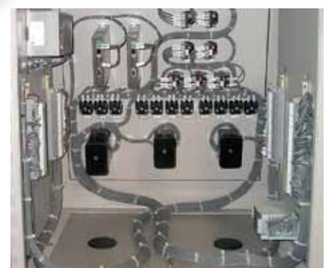
Right: Auxiliary panel sub panel in console base