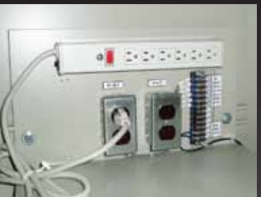
Right: Shelf mounted standard power sub panel