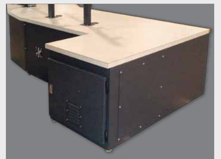
HISTORIAN (OPTIONAL) Expanded storage space for larger PCs or servers.