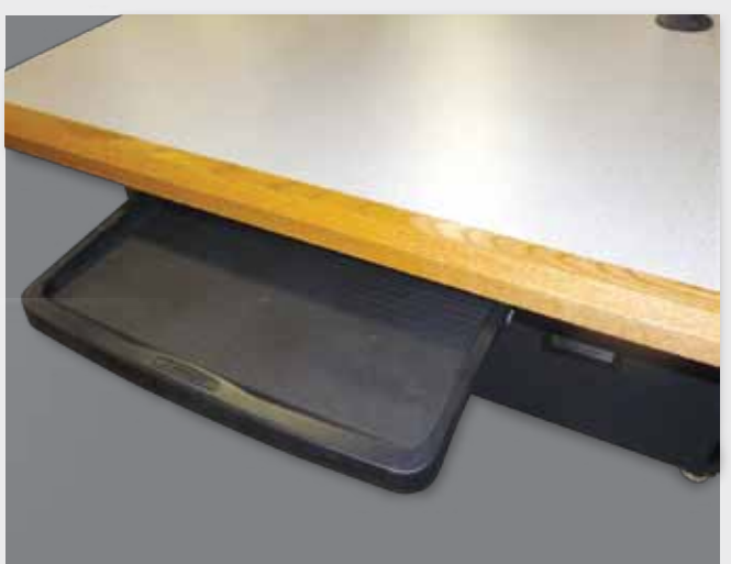
SLIDE OUT KEYBOARD DRAWER (OPTIONAL) Perfect stow away for computer keyboards to keep table tops clutter free.