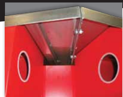
Left: Console with stainless steel desktop available