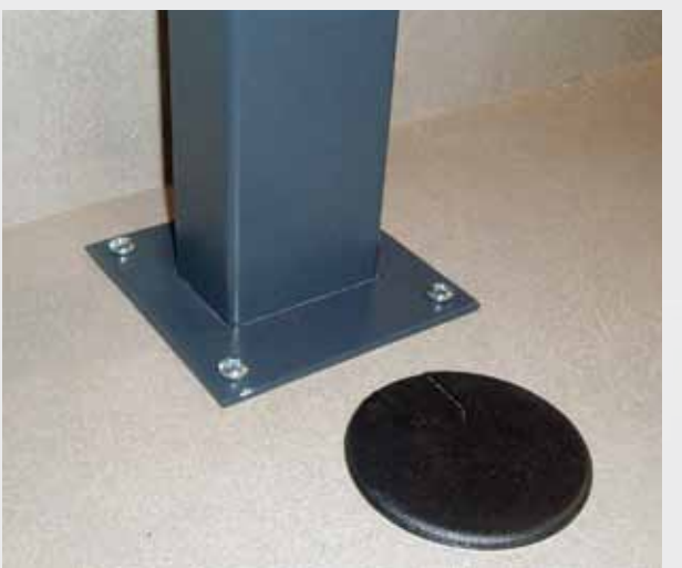
MONITOR CABLE GROMMET (OPTIONAL) Keep computer cables neat and hidden away under the tabletop.