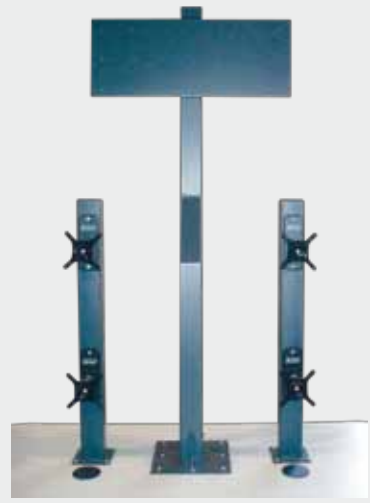
DUAL-HIGH MONITOR MOUNT Customizable mounts are able to hold 1 to 3 monitors high; shown here with optional 40"+ mount.

Panelmatic will deliver a superior custom console designed to your exact specifications enabling an improved and more productive work flow.