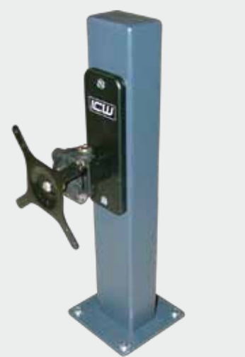
SINGLE-HIGH MONITOR MOUNT Based on customer specs, Panelmatic is able to set ergonomically correct monitor heights.